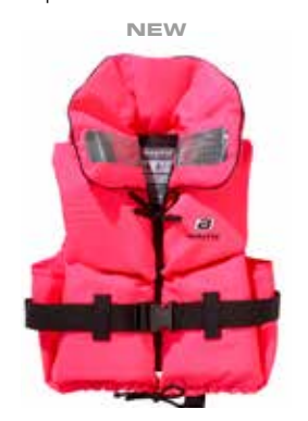
Split Front 1269