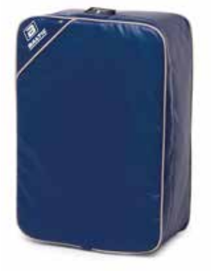
Baltic Rescue sling Navy 9605. Cover Baltic Rescue sling Navy 9615.

Horseshoe buoy Red 8563, White 8560, Yellow 8562 Spare cover Red 9573, White 9570, Yellow 9572