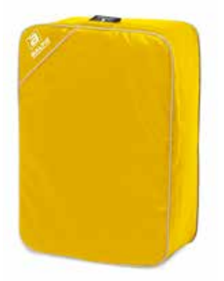
Baltic Rescue sling Yellow 9606 Cover Baltic Rescue sling Yellow 9616